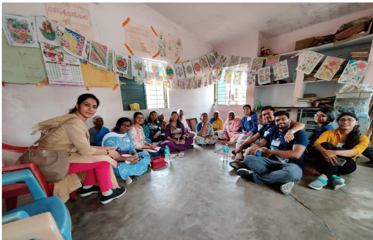
A warm welcome and enthusiasm by elderly people in elderly care center