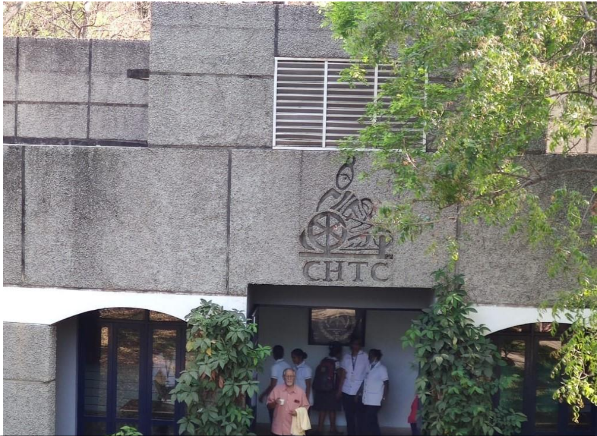
Community Health and Training Centre