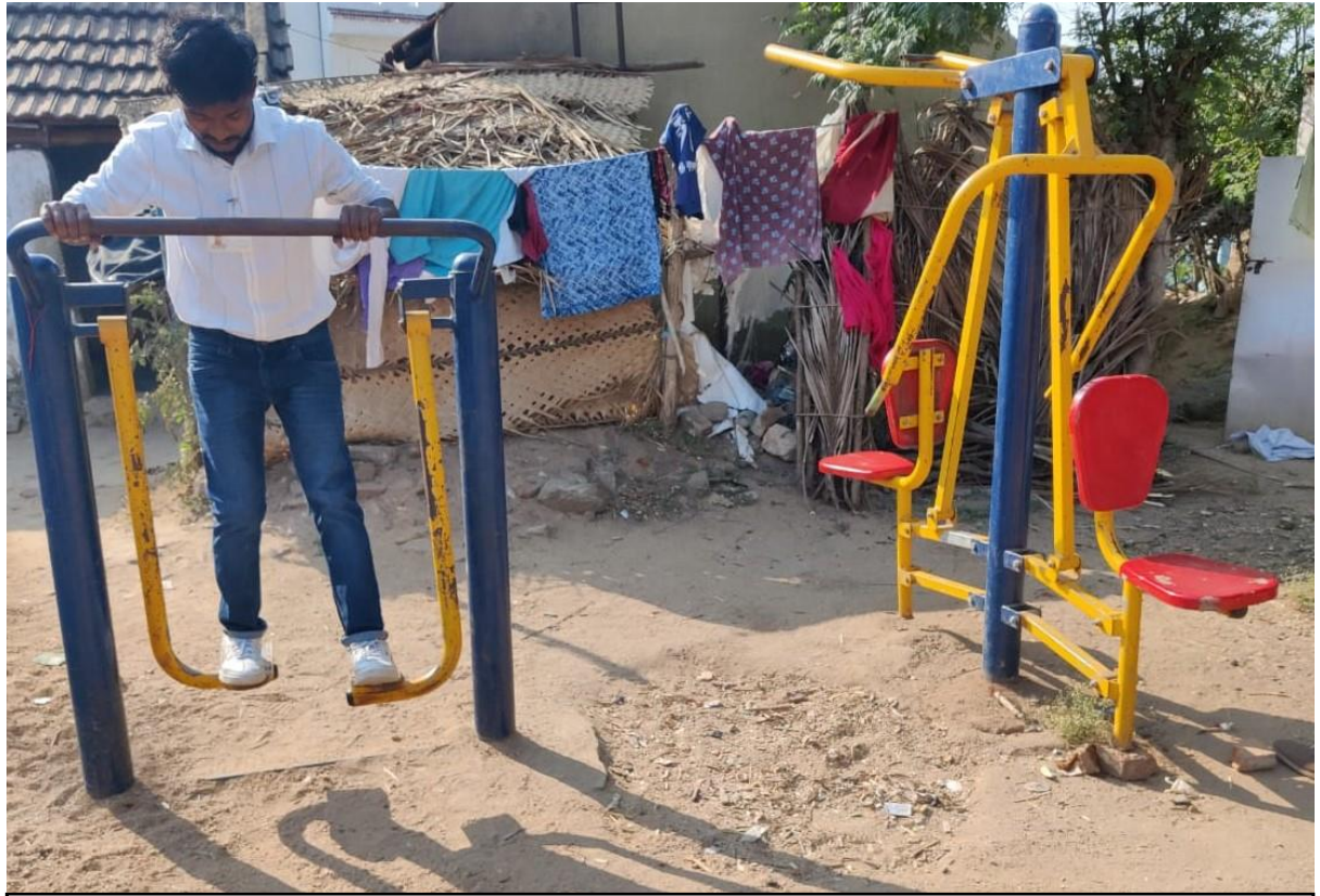
Gym corner for lifestyle modification under the NCDs prevention program