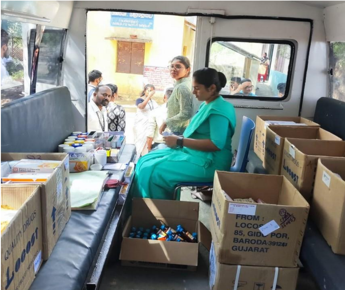
Nurse is distributing medicine in doctor run clinic