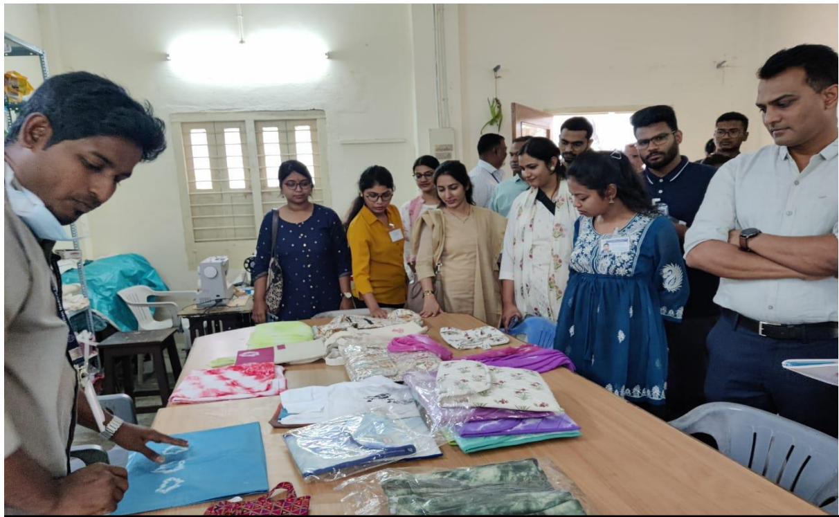
Fashion Designing Training center for women at RUHSA Department