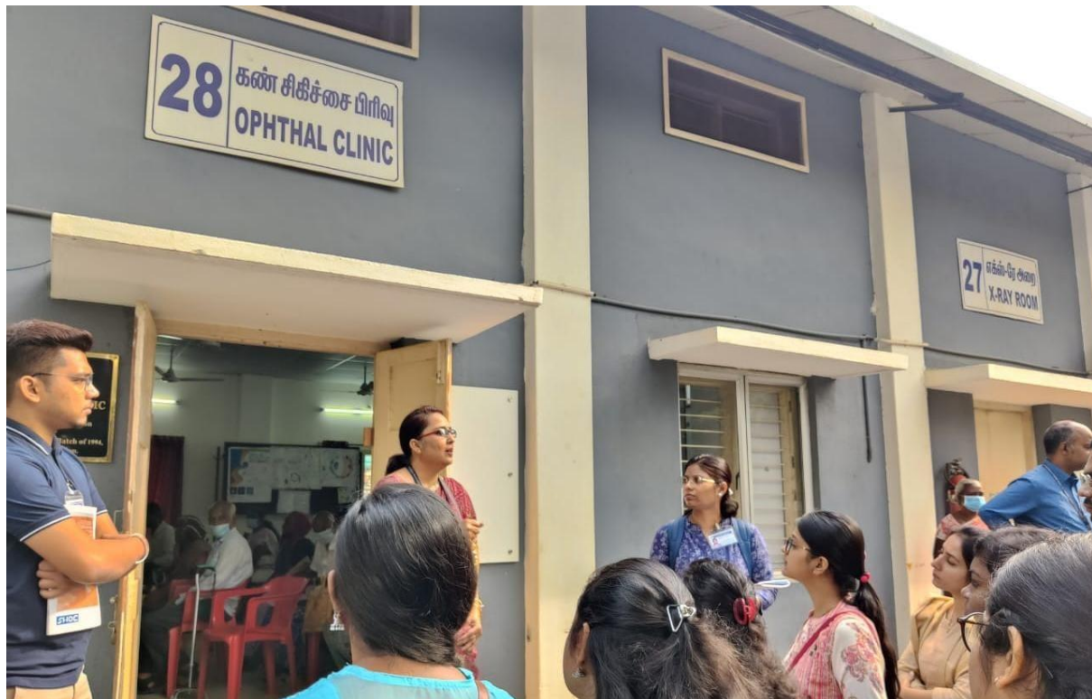
Opthal clinic of RUHSA Department