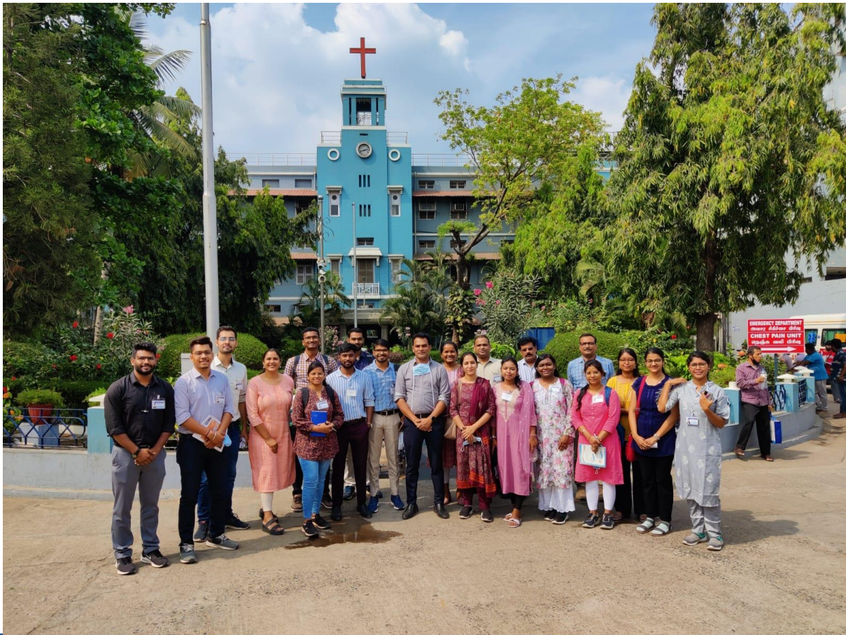
Group photo in front of CMC Vellore Hospital