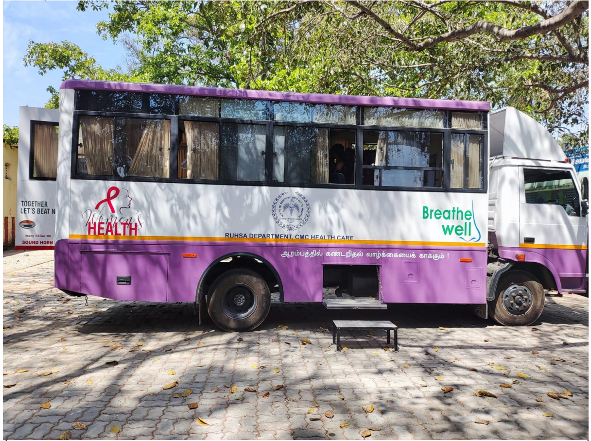
Doctor Run Clinic