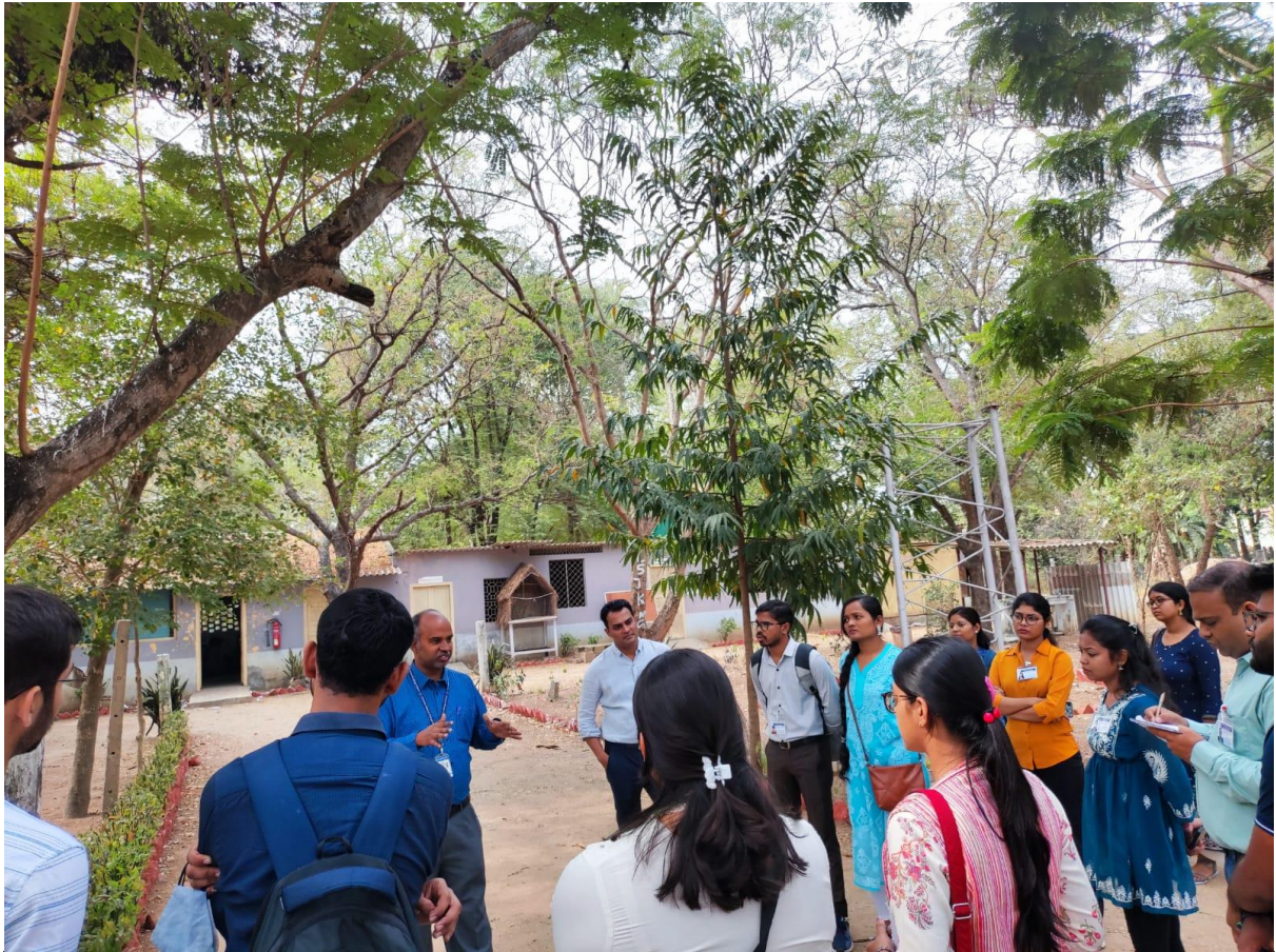
IT Training Centre of RUHSA Department