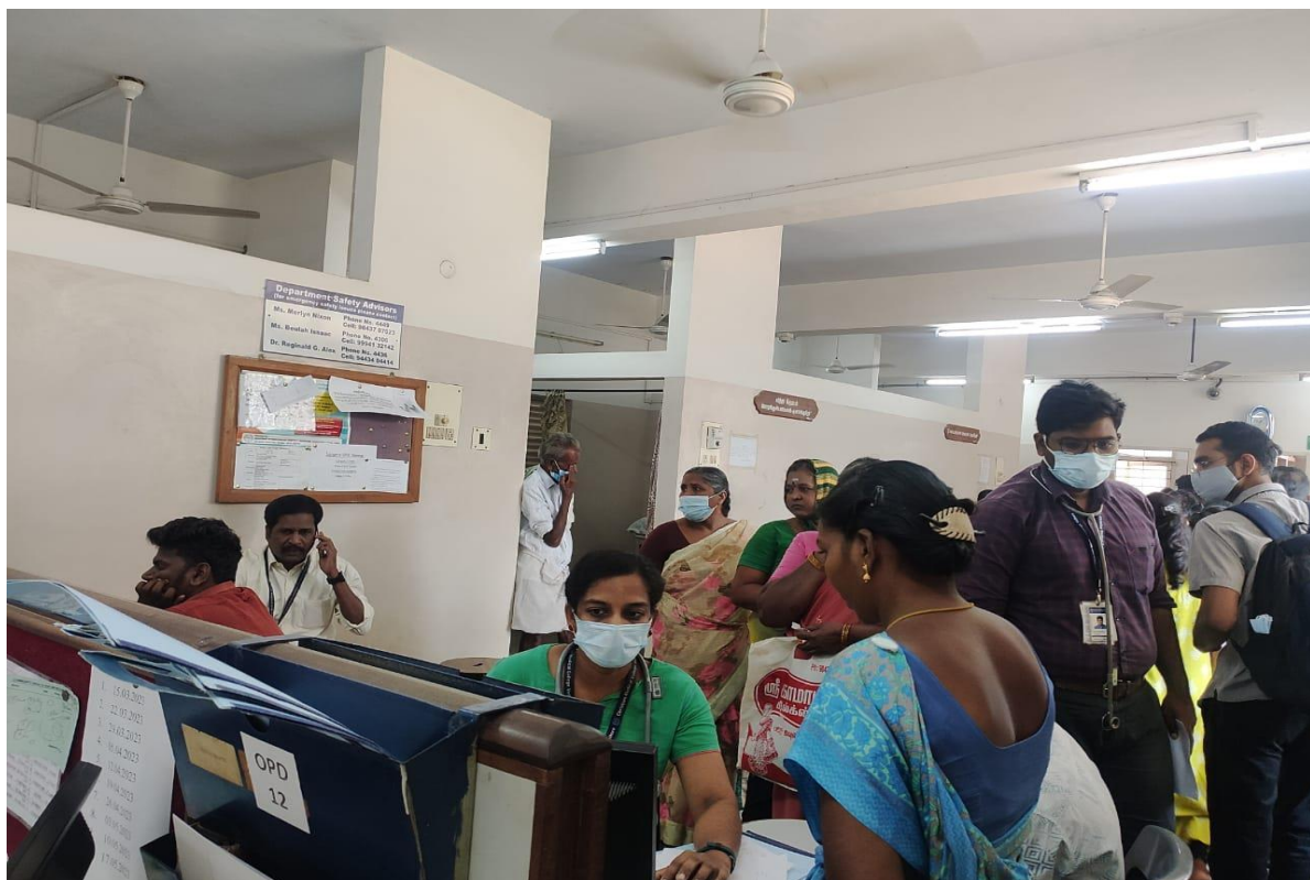
Doctors are attending OPD patients in the cubical area in CHAD Hospital