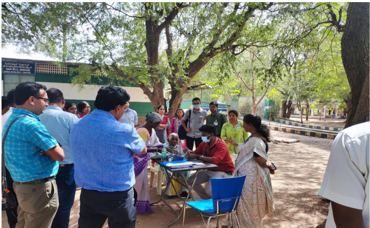
Intern is treating the patient in operational doctor run mobile clinic