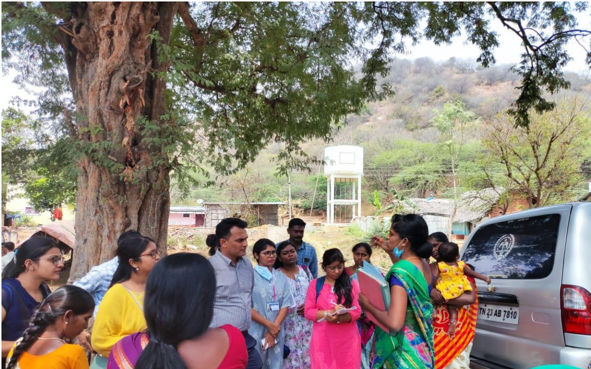
Nurse demonstrating the awareness of Diabetes Mellitus in Nurse run clinic in Thondanthulsai village